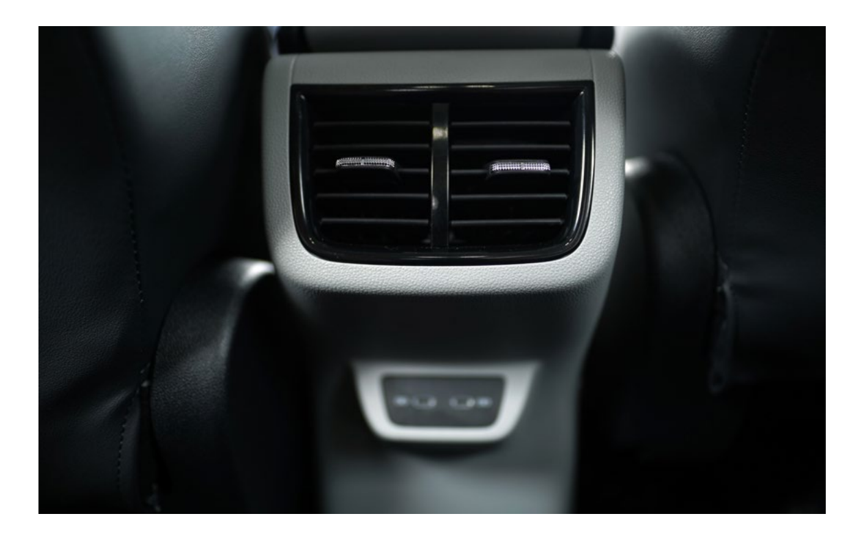
Adjustable Rear A/C Vents The adjustable rear A/C vents ensure comfort for all passengers on-board the Škoda Kushaq.