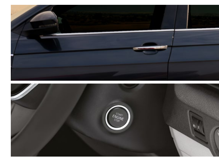
Kessy The Keyless Entry Start & Stop System enables convenient locking and unlocking of the car.

regulation of cabin temperature to ensure that everyone in the car enjoys maximum comfort.