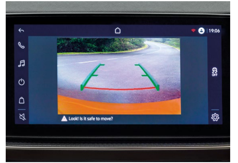
Rear View Camera with Static Guidelines

To make driving and parking a breeze, the car is equipped with a rear camera.