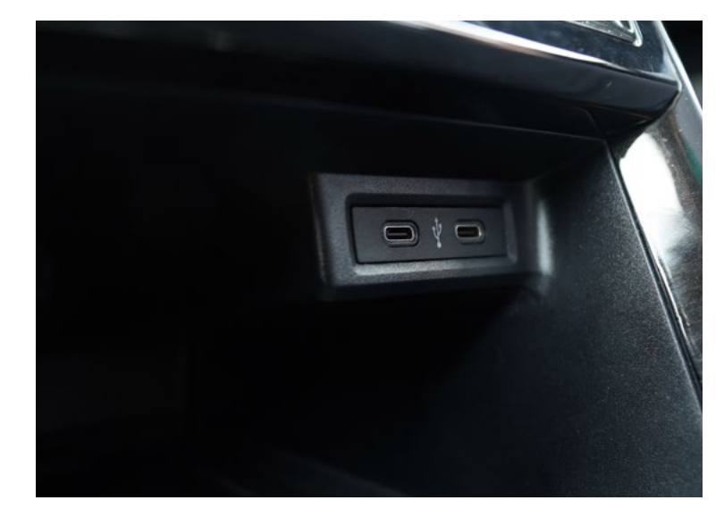
Two USB-C Socket In Front and Rear

To make driving and parking a breeze, the car is equipped with a rear camera.