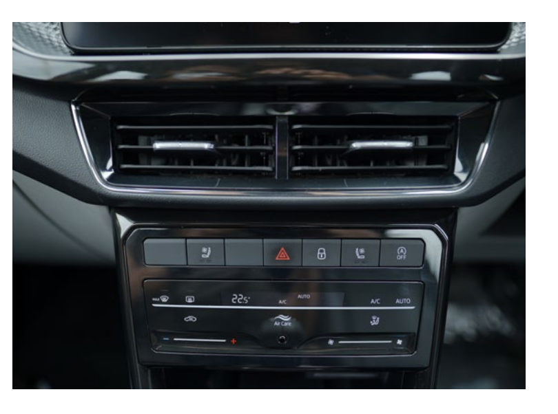
Climatronic A/C with Aircare Function Climatronic automatic air conditioning with electronic

regulation of cabin temperature to ensure that everyone in the car enjoys maximum comfort.