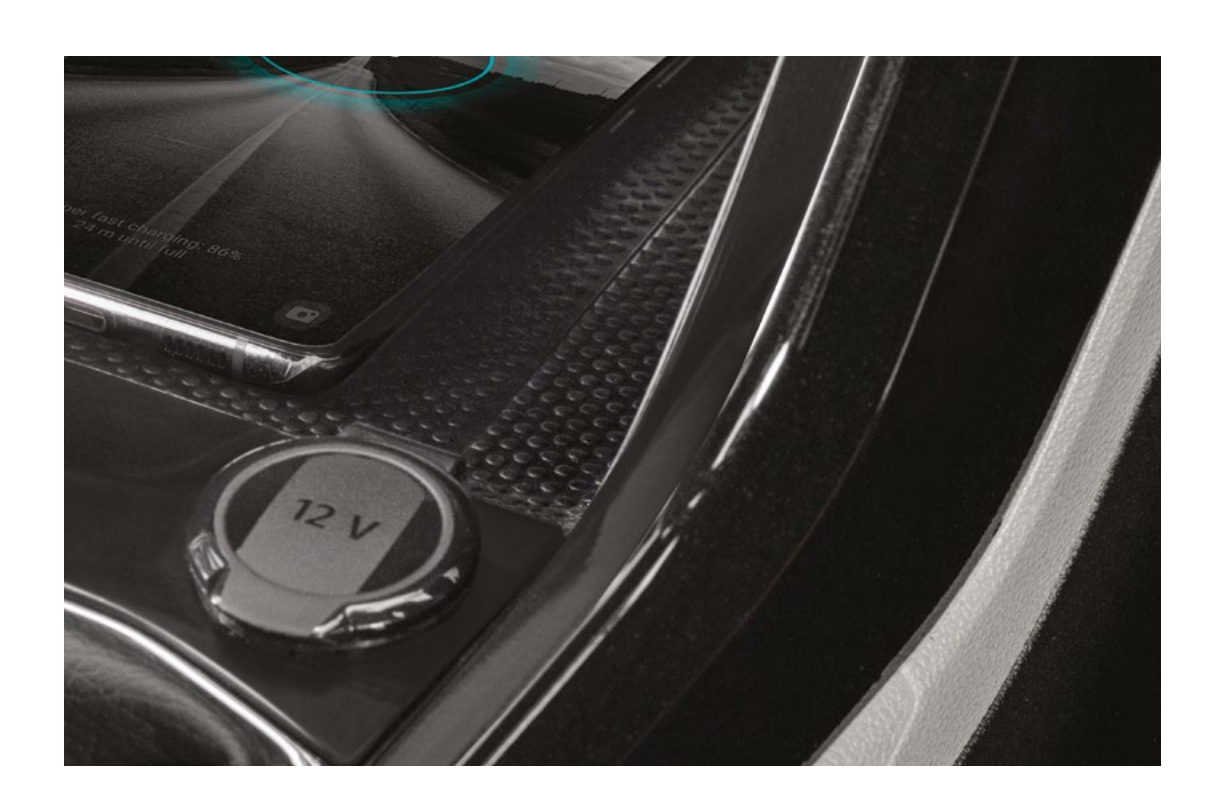
12V Power Socket In Front Centre Console A 12V power socket is provided in the front centre console to give ease of use on the go.